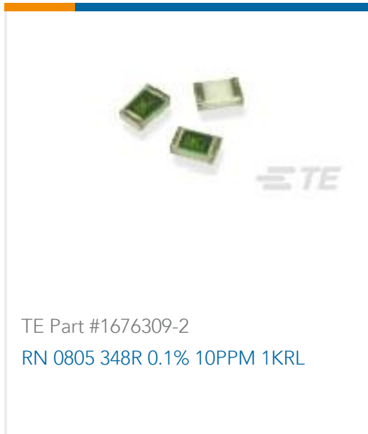
TE Part #1676309-2 RN 0805 348R 0.1% 10PPM 1KRL