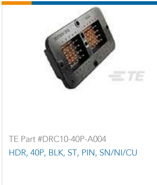
TE Part #DRC10-40P-A004 HDR, 40P, BLK, ST, PIN, SN/NI/CU