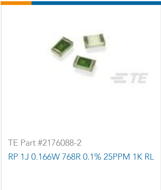
TE Part #2176088-2 RP 1J 0.166W 768R 0.1% 25PPM 1K RL