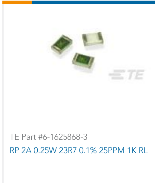
TE Part #6-1625868-3 RP 2A 0.25W 23R7 0.1% 25PPM 1K RL