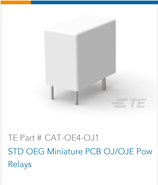
TE Part # CAT-OE4-OJ1 STD OEG Miniature PCB OJ/OJE Pow Relays