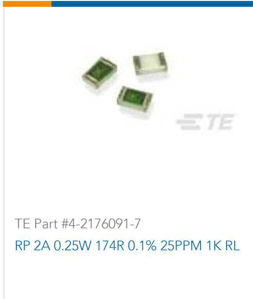
TE Part #4-2176091-7 RP 2A 0.25W 174R 0.1% 25PPM 1K RL