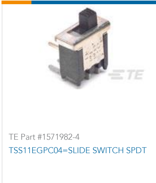
TE Part #1571982-4 TSS11EGPC04=SLIDE SWITCH SPDT