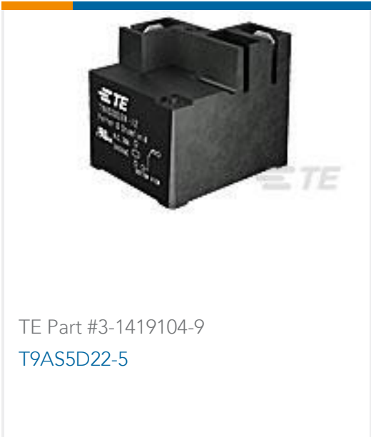
TE Part #3-1419104-9 T9ASSD22-5